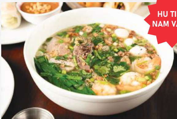
HU TIEU NAM VANG