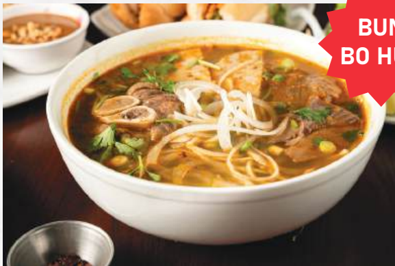
BUN BO HUE

Tender Beef Shank Stew with Rice Noodle, Egg Noodle, or Baguette